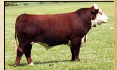
Bird's-Hill 12L Wygan 168W

Ulyssa is a 2 year old, Limelight granddaughter. She is one of those cows that everybody wants. She is very feminine, easy to handle, she has an excellent udder and produces lots of milk. She promotes both moderate size and calving ease. She is doing an excellent job, and putting everything into her first calf. Pasture exposed to an exciting young sire out of Harvie Traveler 69T and Barrons 42H Miss 12L - Bird's-Hill 12L Wygan 168W.