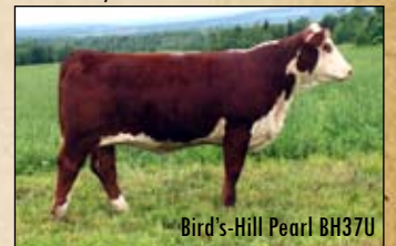
Bird's-Hill Pearl BH37U