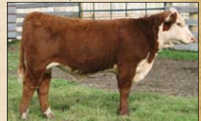
GOLDEN-OAK FUSION 3S

EAGLE-RIDGE BLASTER ET 4J GOLDEN-OAK 4J MAXIUM 28M TA-BAR CHANTELE 15K Sire: GOLDEN-OAK FUSION 3S NCX MISS JR NELLIE 528N NCX 23C JUPITER 16J MFR LASS 113H EPDs BW 3.2 WW 42 YW 70 MM 15.8 TM 34