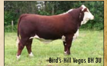
Bird's-Hill Vegas BH 3U