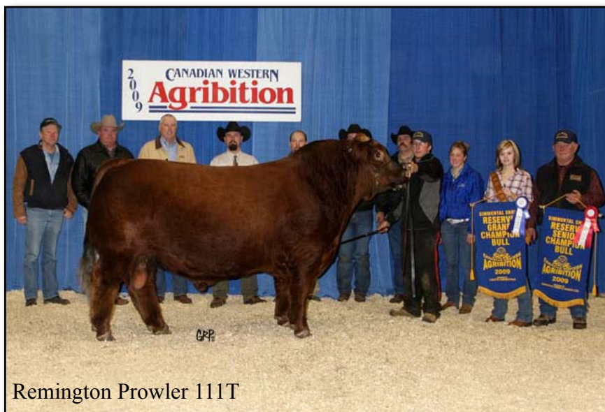
Remington Prowler 111T