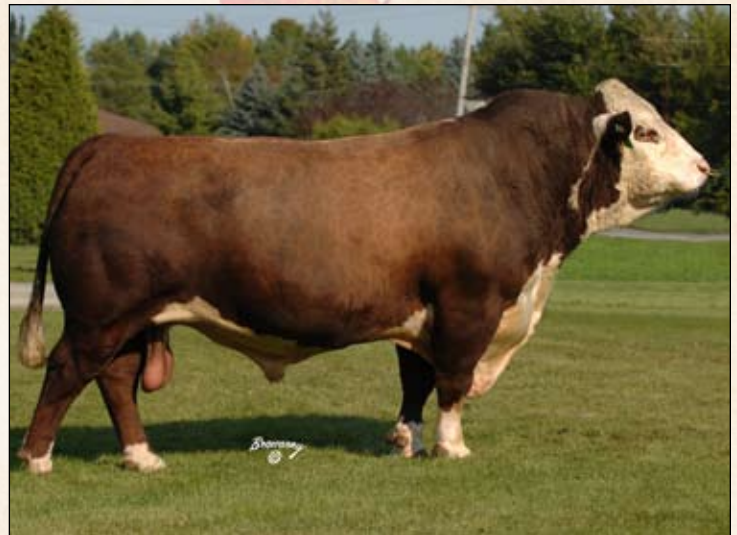
Elmlodge Next Big Thing 3N