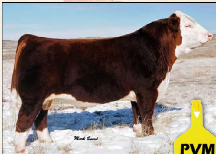
CRR About Time 743