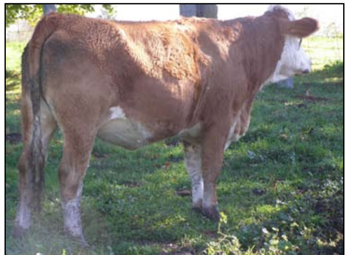
FRYFIELD XCEPTIONAL 9X