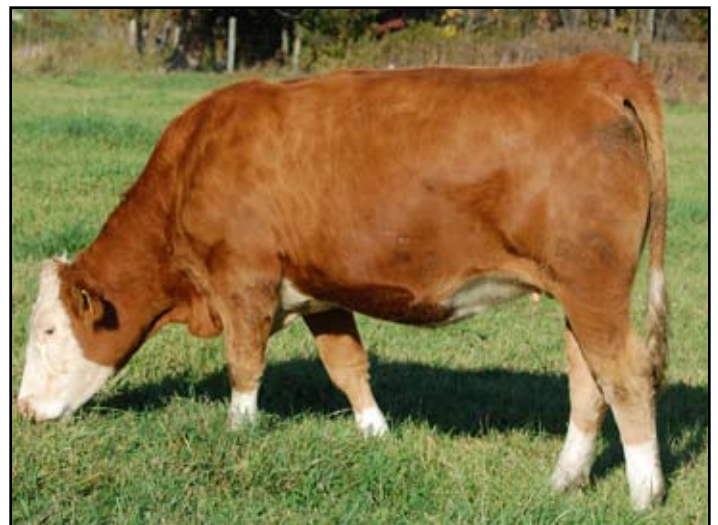
ROBSON ACRES XANTHIA

Exposed to Sullys Tank 3T (PG675303) from April 10 to June 21/11.