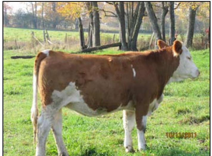
FVFR RED FLORA 37X