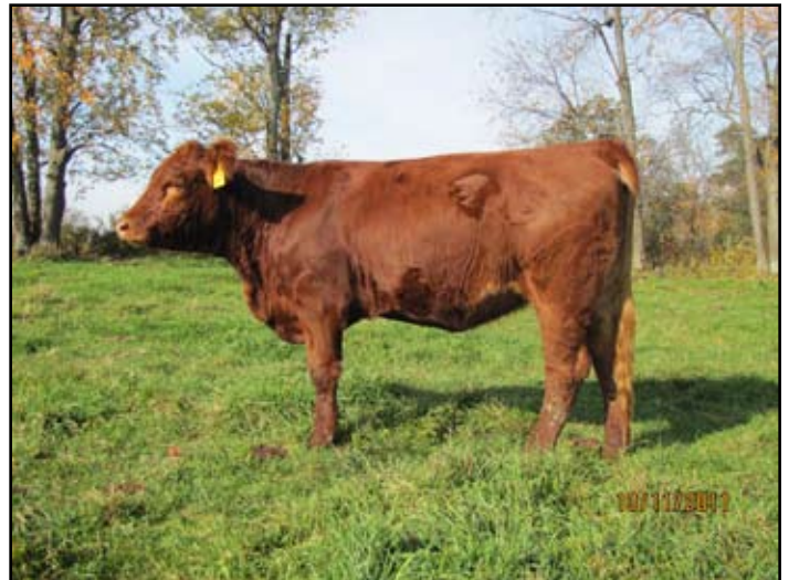
FVFR RED ROSE 34X