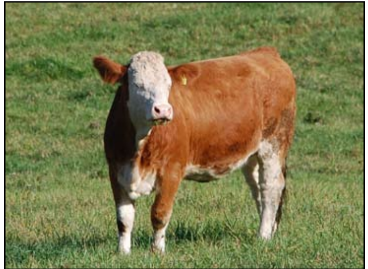
ROBSON ACRES XANTRA

Exposed to Sully Tank 3T (PG675303) from April 10 to June 21/11.