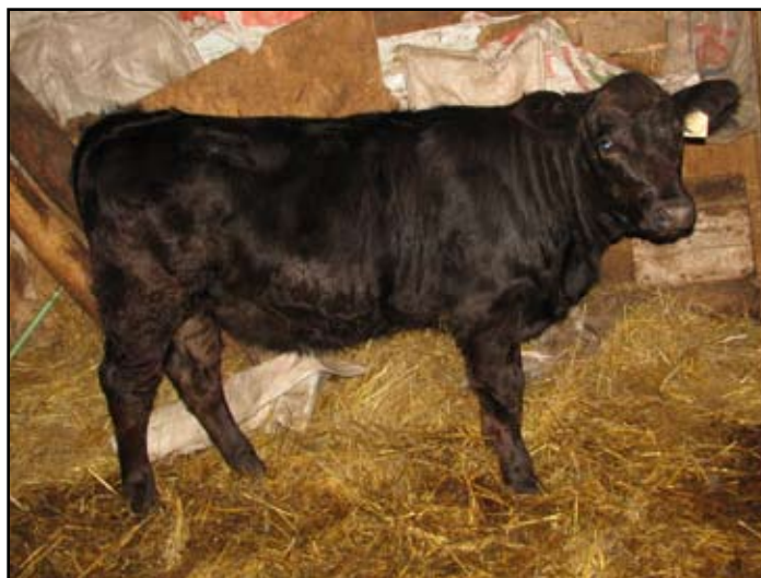
MOUNTAIN RD Y NOT

Y Not is a good solid black heifer, off a two year old. Mom milks great. These In Due Time heifers made great cows. Consigned by: MOUNTAIN RD SIMMENTALS