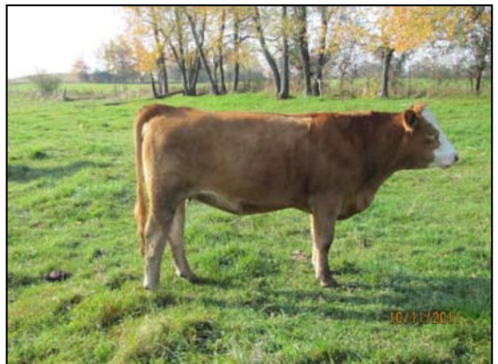
FVFR RED MS MANTLE 23X