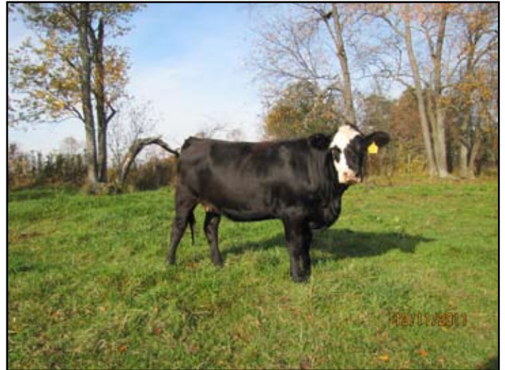
FVFR BLK HEATHER 11X

Bred: Lchmn Bright Light L122L "Hoosier" April 1/11. Due: January 10/12