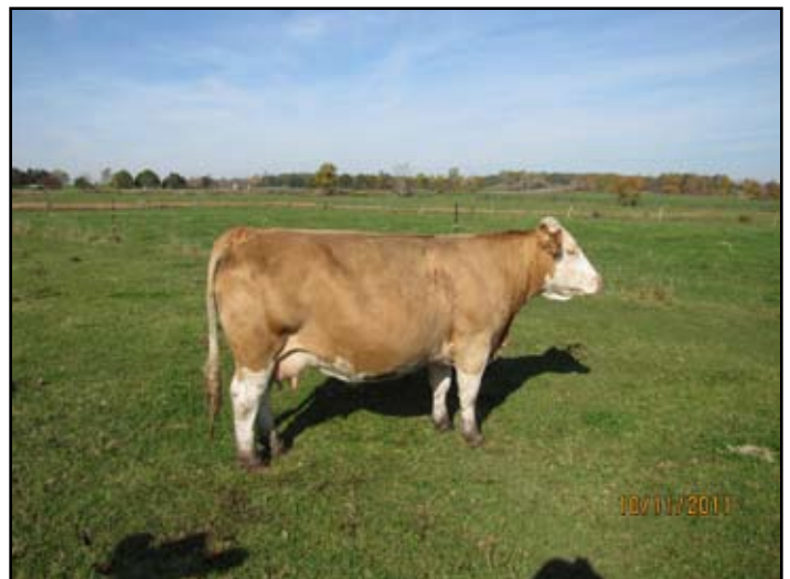
FVFR PRINCESS 7P