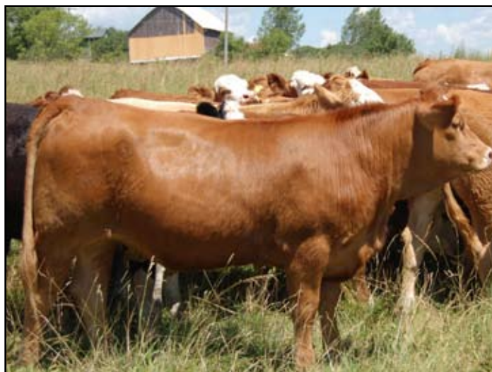
ROBSON ACRES XANTARA

Exposed to Robson Acres X-treme Boy (BPG727612) from Aug 20 to Nov 1/11.