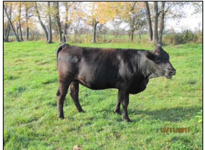
FVFR BLK MAID 10X