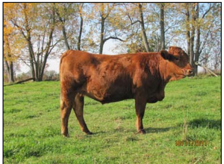
FVFR RED HAYLEY 12X