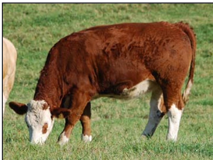
ROBSON ACRES XAVIERA

Exposed to Robson Acres Ugger (PG692603) from Sept 7 to Nov 1/11.