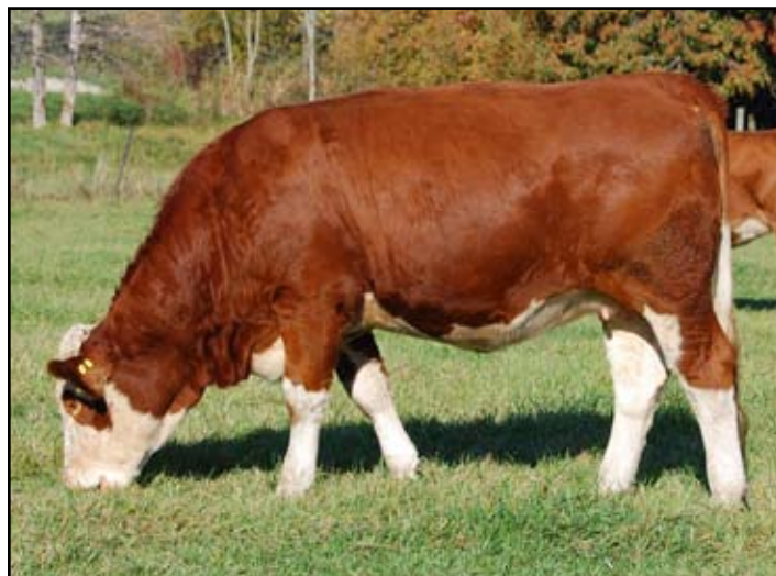
ROBSON ACRES X-SCAPE

Exposed to Sullys Tank 3T (PG675303) from April 10 to June 21/11.