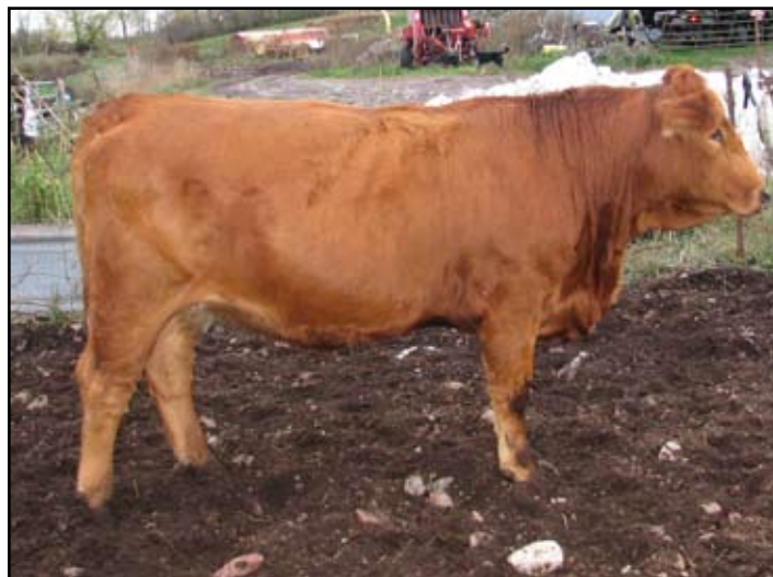
MOUNTAIN RD XSTATIC 15X

Xstatic is from a first calf heifer and what a job she has done. Xstatic will be a big broody cow. She will make her new owner proud. Observed bred to Mountain Rd Mador on May 29th 2011. Exposed to Mountain Rd Mador from May 16th to Sept 5th, 2011. Consigned by: MOUNTAIN RD SIMMENTALS