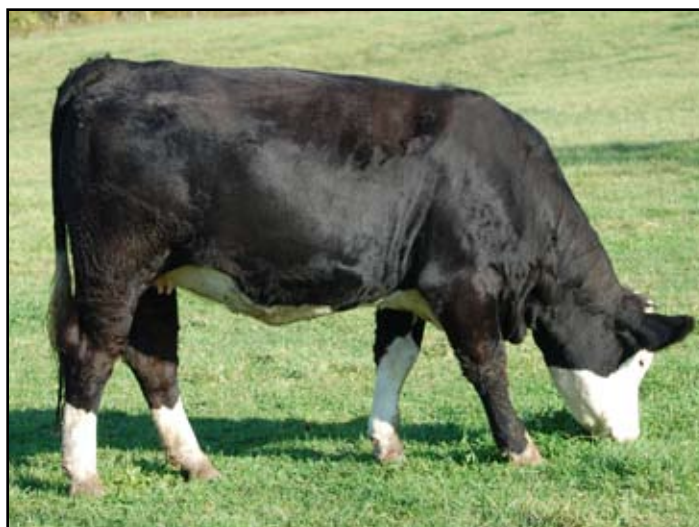
ROBSON ACRES XPRESSO

Exposed to Sullys Tank 3T (PG675303) from April 10 to June 21/11.