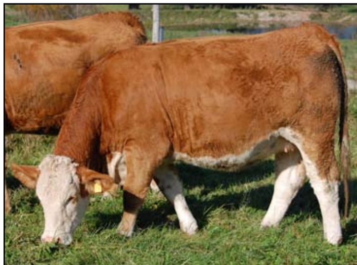
ROBSON ACRES XQUISITE

Exposed to Sullys Tank 3T (PG675303) from May 18 to June 21/11.