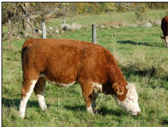
ROBSON ACRES XCITING

Exposed to Robson Acres Ugger (PG692603) from Sept 7 to Nov 1/11.