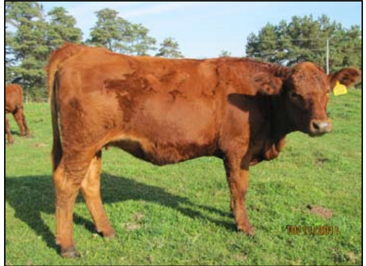
FVFR RED LADY 15X