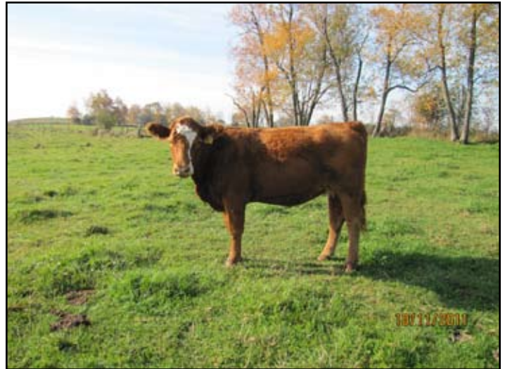
FVFR RED LACEY 7X