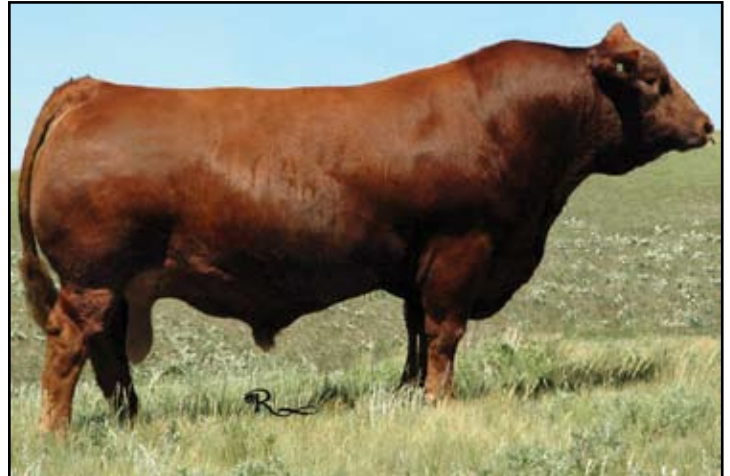
REMINGTON RED LABEL HR

Exposed to Robson X-treme Boy (BPG727612) from Aug 20 to Nov 1/11.